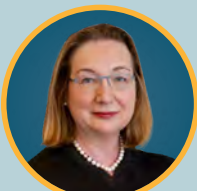
Chief Judge Beryl Howell