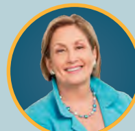
Jamie S. Gorelick