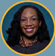
U.S. Supreme Court Justice Ketanji Brown Jackson