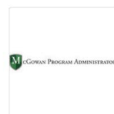
McGowan Active Shooter Programs