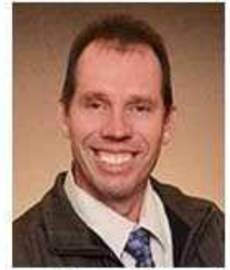
Billy Boulden Lake of the Ozarks