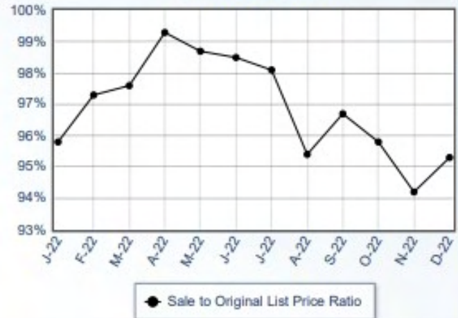
Sold to List Ratio