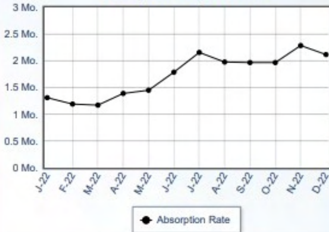
Absorption Rate, in Months