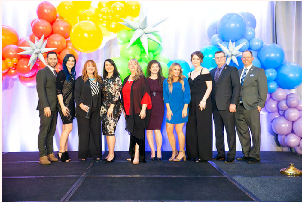
OGAR State Directors and Committee Members representing at the MR Installation Banquet