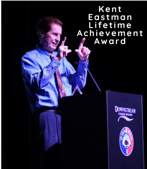
Kent Eastman Lifetime Achievement Award