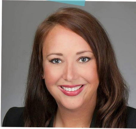
2018 President National Association of REALTORS®