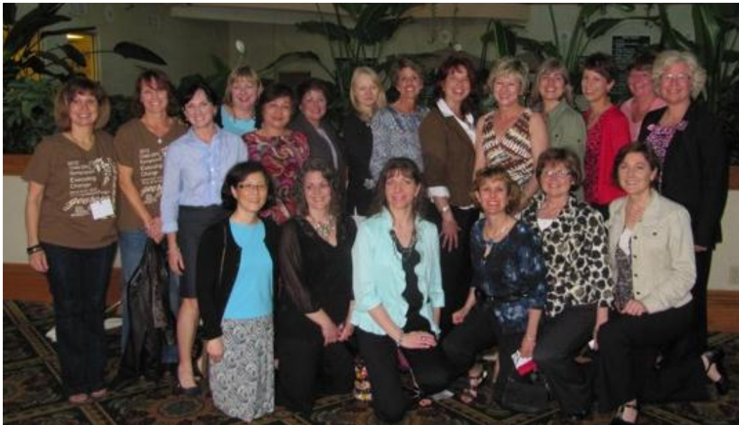
CNM Executive Committee (2011-2012)