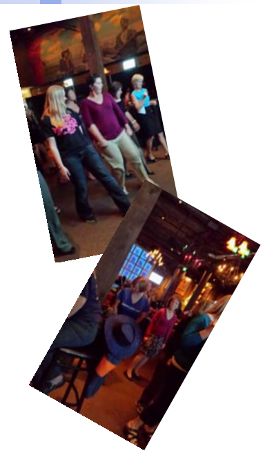
2013 Member Reception House of Blues, Houston