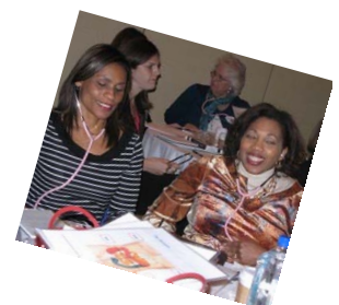
2014 PreFNCE Workshop