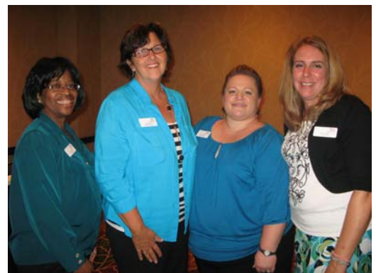
2014-15 EC at work