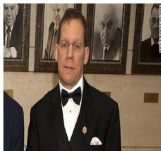
Dr. Charles Lieber