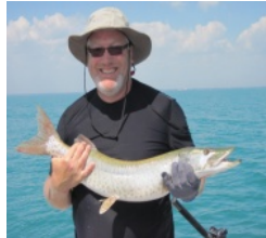
Jac Lentz Plains Natural Gas Storage

Abstract: There are very few reservoirs that have produced both oil and gas under primary production and have been converted to gas storage; the Columbus III field is one of these. The Columbus III field under primary production produced 7.9 MMbo, 1.1 MMb NGL's and 19.5 Bcfg from the A1 Carbonate/Brown Niagaran reservoir. The field was converted to gas storage in 2003-2004 utilizing nine (9) dual and single leg horizontal wells in the gas cap, and six (6) dual and single leg horizontal wells were drilled along the bottom of the original oil zone to recover oil. Subsequent to the storage conversion, three (3) vertical wells have been drilled for oil recovery, and one original Niagaran brine injection well has been re-completed to the Detroit River Group for produced brine disposal. At least three (3) static reservoir models have been built and as many or more predictive simulations have been run on the reservoir over the years for both gas deliverability and oil production forecasting. This presentation will focus on the development of oil recovery system.