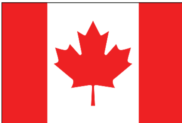
Flag of Canada

The organizing committee did a fantastic job of planning, organizing and ensuring a truly inspiring and worthwhile workshop. Bravo! Thank you to all who made this workshop so memorable. I hope to be in Virginia next year.