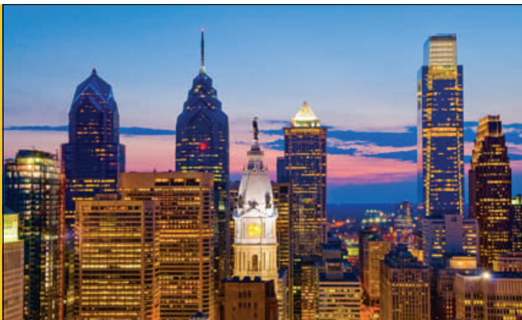
Photo of the Philadelphia Skyline from the SLA Conference web site