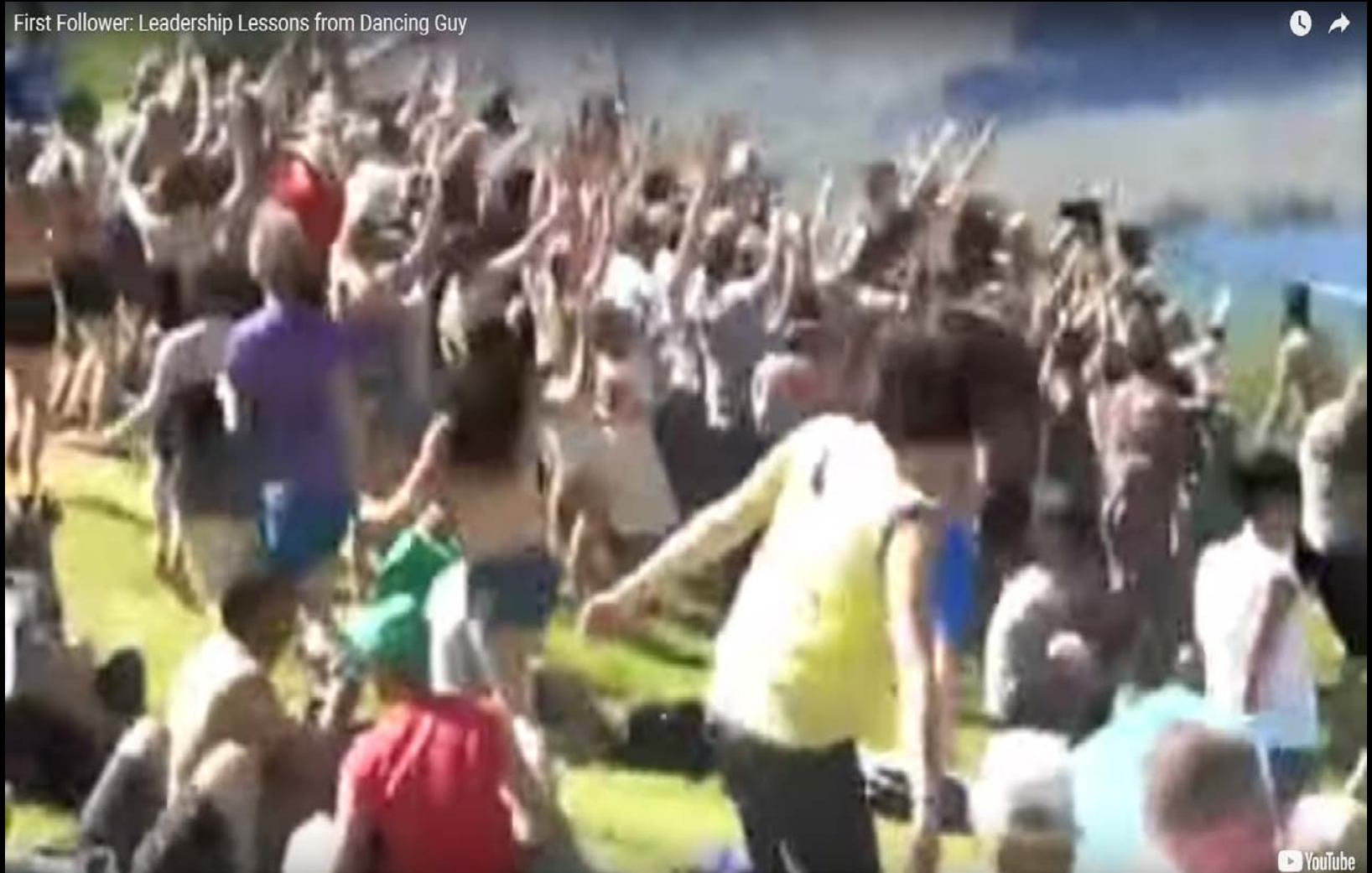
First Follower: Leadership Lessons from Dancing Guy