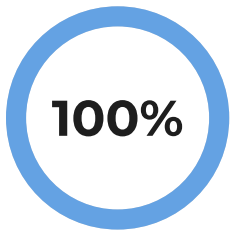
'Much Better' relative to other CIO offerings