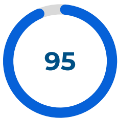
Net Promoter Score

Best for senior leaders seeking deep peer connection and candid dialogue beyond traditional events.