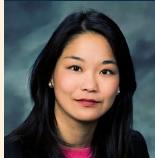
Chief Risk Officer East West Bank