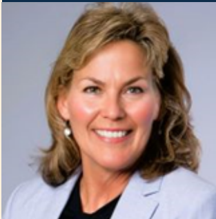
Chief Risk Officer Farmers & Merchants Bank of Long Beach