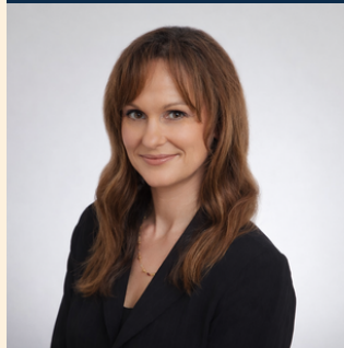
First Senior Vice President, Strategy, Operations, & Marketing MidFirst Bank