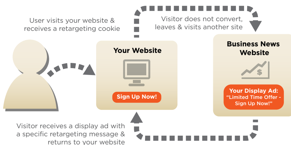
A basic look at how retargeting works

Businesses can use cookies to create specific retargeting pools of Web visitors who have previously taken specific actions, such as visiting a website or searching for a particular product, even if they did not convert at the time. You can then repeatedly display your ads to prequalified prospects as they travel across the Web, encouraging them to return to your website and eventually convert into buyers.