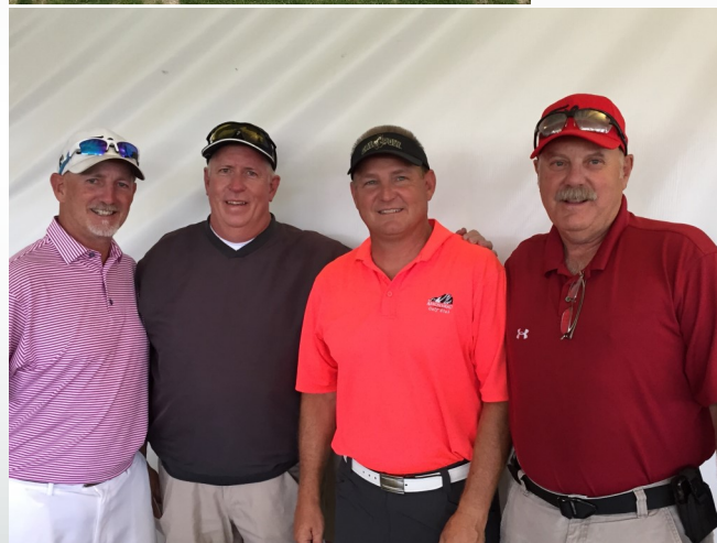
The MYR Group, Inc. took 1 st !

If there was a prize for the best dressed team the McLarens team would have been a contender!