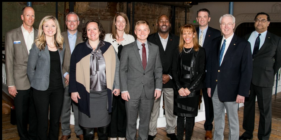
Travelers and Travelers Institute presented to national and local leaders at the 200+ attendee Distracted Driving Symposium, co-sponsored by CU Denver RMI Program.