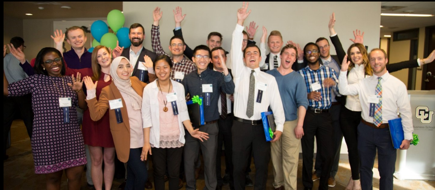
Congratulations to Fall 2017 and Spring 2018 graduates!

CU Denver thanks Rocky Mountain RIMS for your support of UCD RMI students!