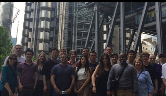
Global Risk Management students visited London this May.