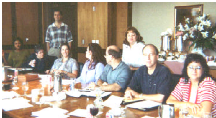
The RIMS Board at work. This picture is from the retreat in Galveston. Work all day, eat and sleep and play the next day. See the article in the RIMS News September 2001. If you don't have your copy it is available on the web site.