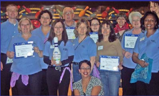
Glad to be done with the Laser Tag