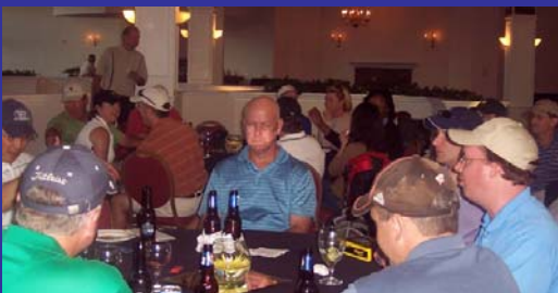
Relaxing after a hard day of golf & laser tag

Please see our Chapter Website for additional information: