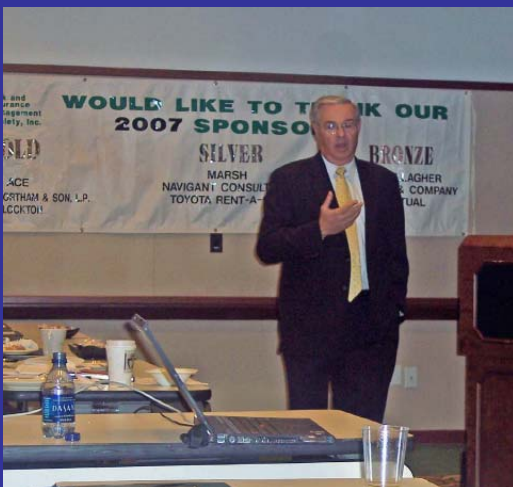
Interesting Subjects & Great Teachers