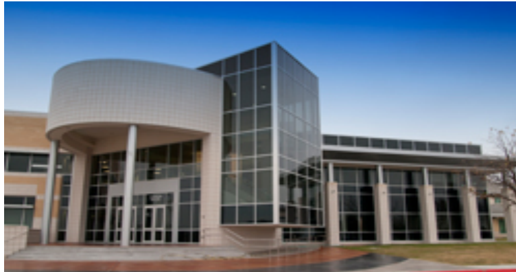
PRESTON RIDGE CAMPUS CONFERENCE CENTER FRISCO, TEXAS