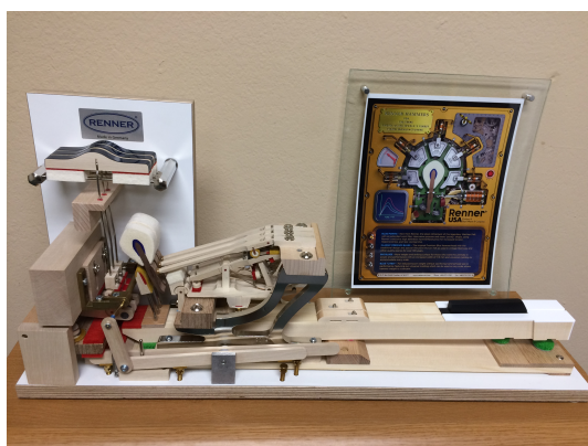
Renner is making the new 3-key grand action model for PTG. It was on display at Phoenix Chapter's September meeting.