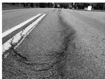
An insufficient tack coat application can lead to pavement failure.

Applying a bituminous tack coat is an integral part of an asphalt paving project. Research by the asphalt industry and PennDOT on the use of tack coat has resulted in some recent changes to PennDOT's construction specifications. Whether you do your road paving in-house or contract it out, your municipality must be aware of these changes.