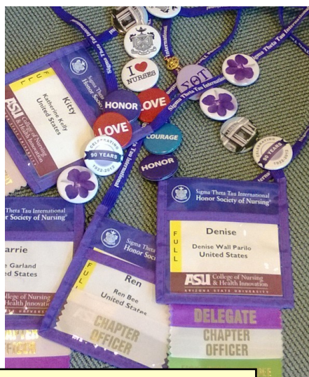
Attendee badges became a great place for collecting STTI pins