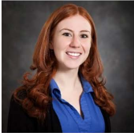
Ramona Lesley Dedicated Service Award