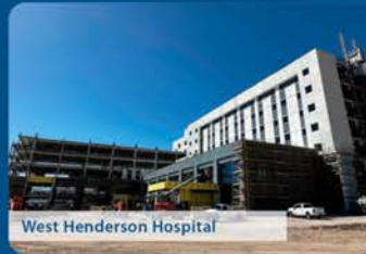
West Henderson Hospital