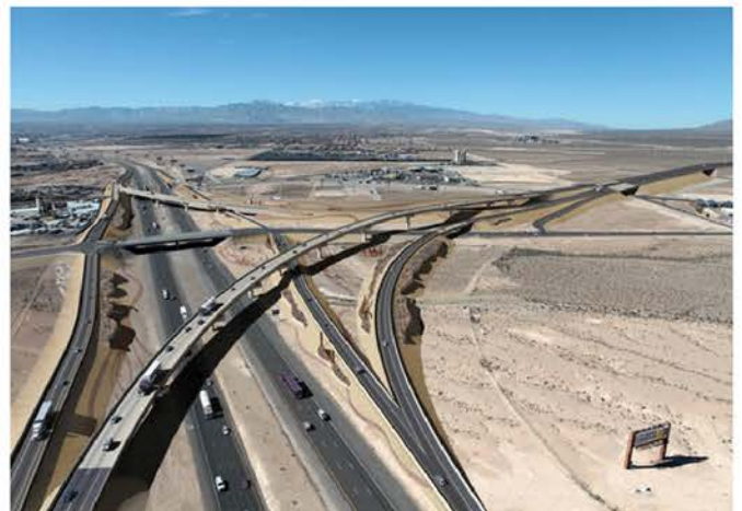
Project of the Year