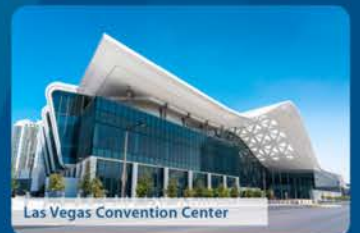
Las Vegas Convention Center