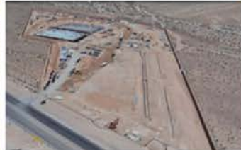
Cougar 3090 Zone Reservoir