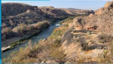
Lower Las Vegas Wash Stabilization Program