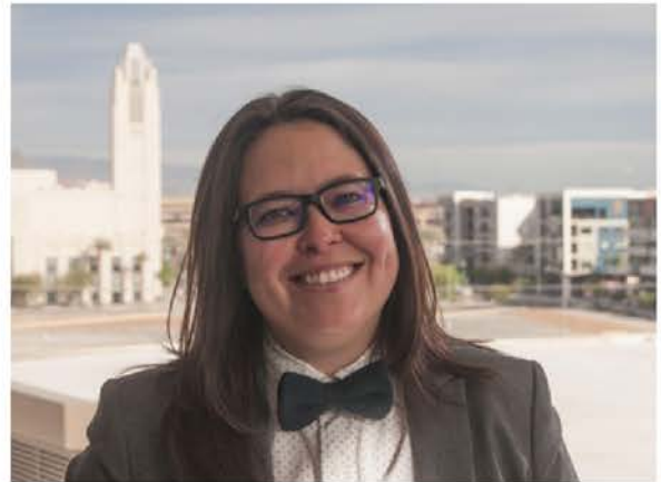
Young Engineer of the Year