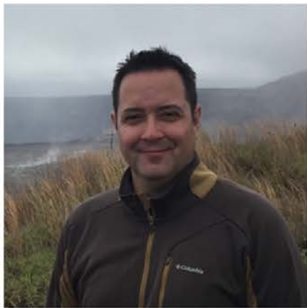
Engineer of the Year