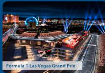
Formula 1 Las Vegas Grand Prix

Environmental Consulting Geotechnical Engineering Materials Testing & Inspections Occupational Health & Safety Building Sciences & Code Compliance Virtual Design Consulting