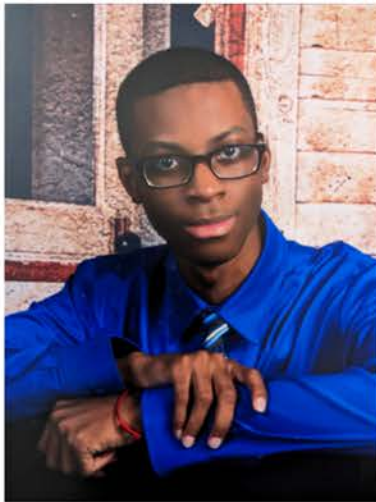
Outstanding Achievement Award