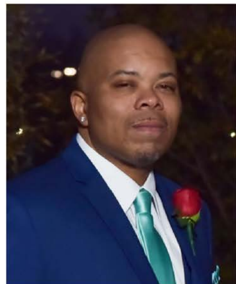
Outstanding Service Award