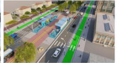
Reimagine Boulder Highway