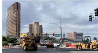
Las Vegas Boulevard CM