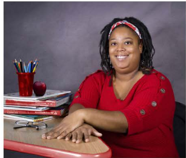
Outstanding Service Award