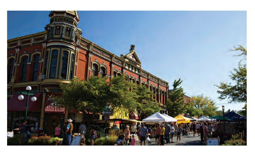
The Main Street Approach was developed with the understanding that small, incremental improvements, when taken together, provide momentum for long-term economic transformation and improved quality of life in a community.

However, successful economic development is rarely about the one big thing. American communities are littered with projects that were sold as the "silver bullet" solution to a city's economic woes. Whether it was a convention center, a casino, a new factory or a big box store out on the highway, city after city has followed the copycat logic of big project mania. Cities would be much better off dedicating their time and efforts toward smaller things that work synergistically together in a plan that makes sense.