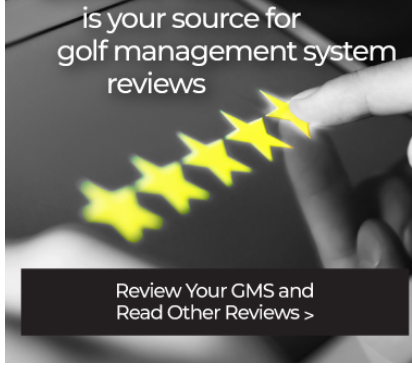
Stay informed! Read reviews on Golf Management Systems (GMS), and write your own to help your peers.

Registration is OPEN. Secure your space in-person in Las Vegas at the ARIA Resort & Casino OR remotely for the Golf Business RevCon 2020!