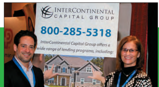
Enjoying and Learning on the Exhibitor Floor