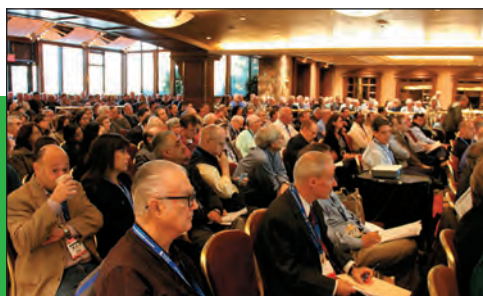
Exhibitors and Attendees celebrating a great event!