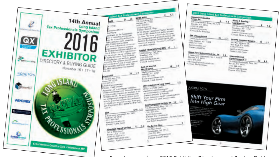
Sample pages from 2016 Exhibitor Directory and Buying Guide.

In addition, the Exhibitor Directory & Buying Guide is distributed at other NCCPA National and Nassau/Suffolk Chapter events throughout the year. It is a year-round reference guide.