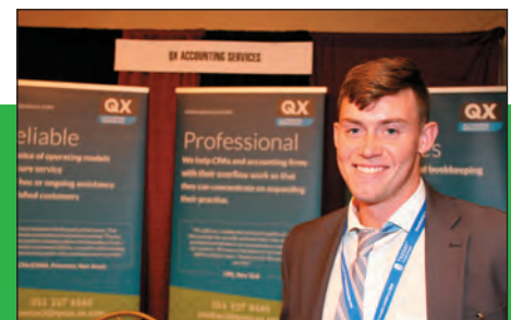
Enjoying and Learning on the Exhibitor Floor