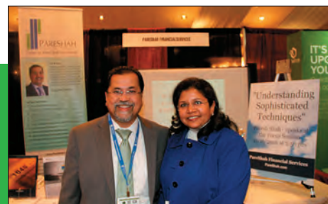
Welcome to LITPS and Exhibitor Floor