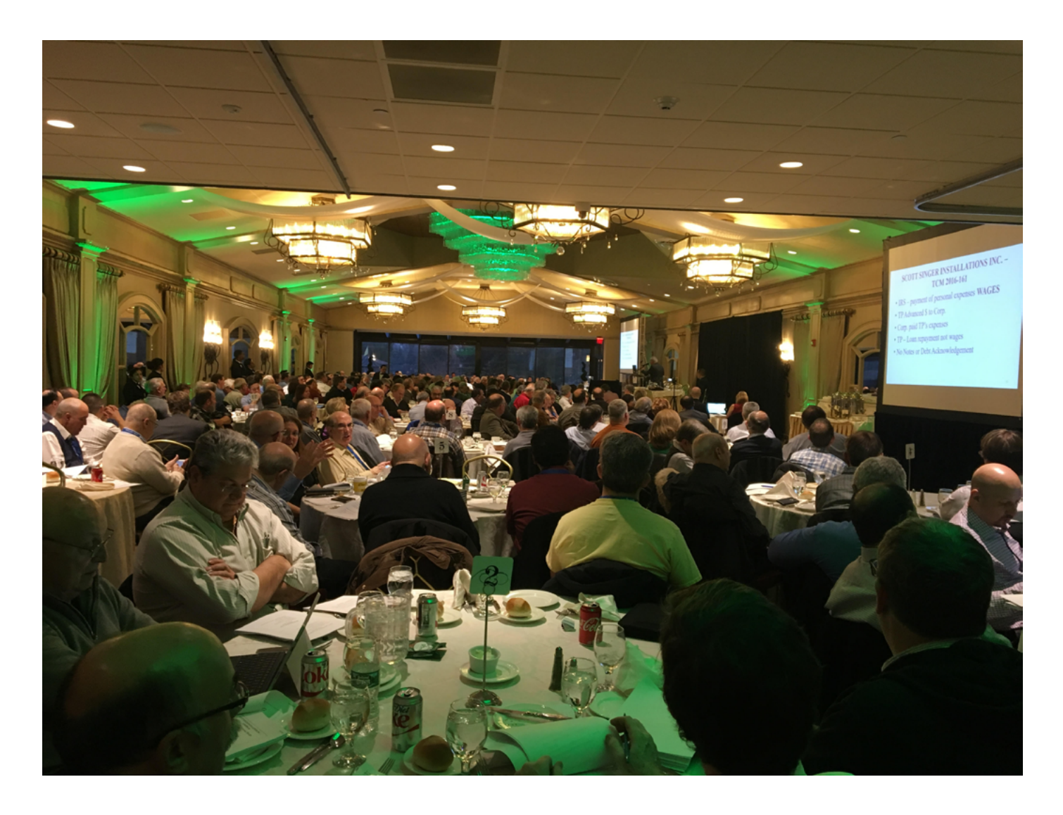
RECORD BREAKING ATTENDANCE AT OUR THREE-PART SEMINAR REGARDING THE TAX CUTS AND JOBS ACT!