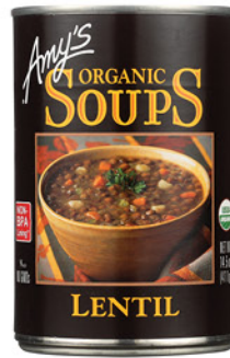
Amy's Organic Soup (selected varieties)