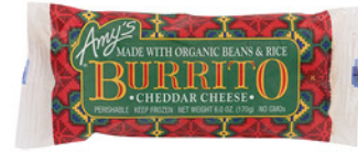
Amy's Burrito (selected varieties)