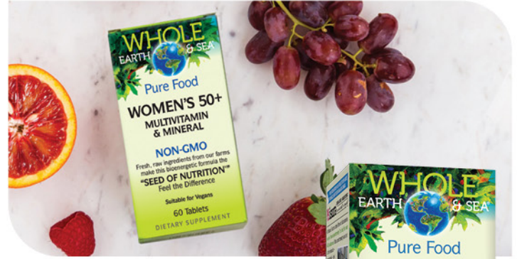
Natural Factors Men's & Women's Whole Earth & Sea™ Multivitamin & Mineral (selected varieties)