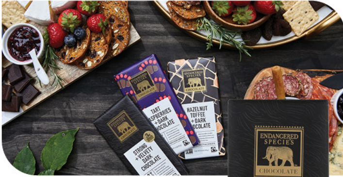
Endangered Species Chocolate Bar (selected varieties)