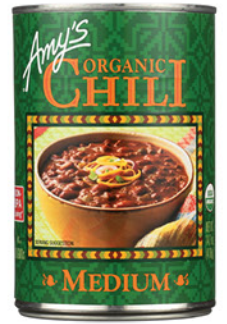
Amy's Organic Chili (selected varieties)