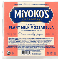
Miyoko's Organic Vegan Mozzarella