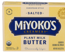
Miyoko's Organic Cultured Vegan Butter

Built on the foundation of craft and compassion, Miyoko's Creamery is the natural, compassionate evolution of dairy—using time-honored techniques and the finest ingredients to make our award-winning, phenomenally vegan, plant-milk butter and cheese.