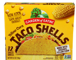
Garden of Eatin' Taco Shells