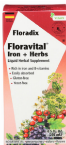
Floradix Floravital Iron & Herbs