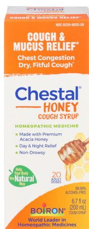
Boiron Chestal Honey