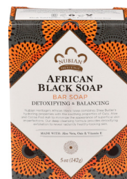
Nubian Heritage African Black Bar Soap