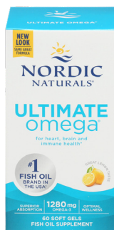
Nordic Naturals Ultimate Omega