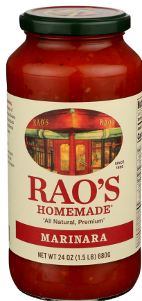
Rao's Homemade Pasta Sauce