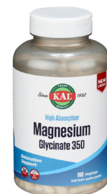
KAL Magnesium Glycinate 350