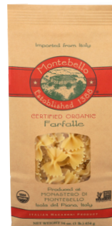
Montebello Organic Artisan Pasta (selected varieties)