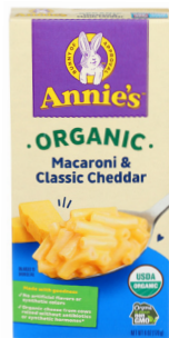
Annie's Organic Mac & Cheese (selected varieties)