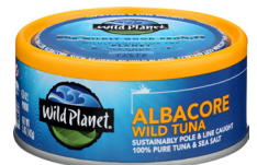
Wild Planet Wild Albacore Tuna