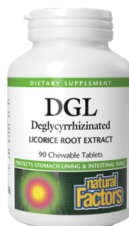
Natural Factors DGL 400 mg Chewable