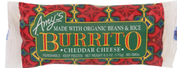
Amy's Burrito (selected varieties)