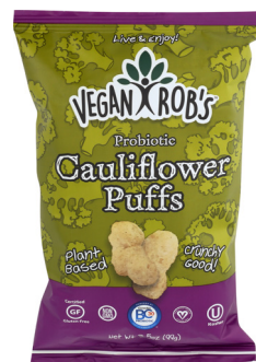
Vegan Rob's Puffs