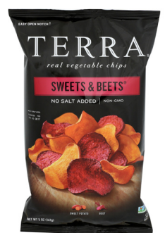
Terra Vegetable Chips (selected varieties)