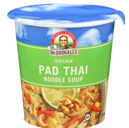
Dr. McDougall's Soup Cup (selected varieties)