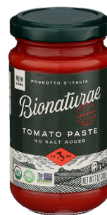
Bionaturae Organic Tomato Paste