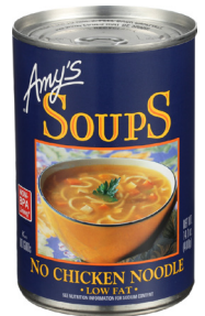
Amy's Soup (selected varieties)