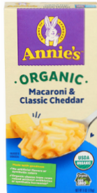
Annie's Organic Mac & Cheese (selected varieties)