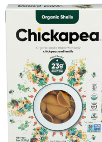
Chickapea Organic Chickpea Pasta (selected varieties)