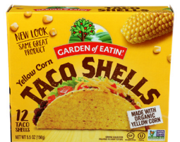
Garden of Eatin' Taco Shells