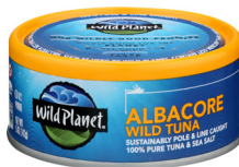
Wild Planet Wild Albacore Tuna