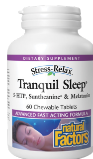
Natural Factors Stress Relax® Tranquil Sleep Chewable