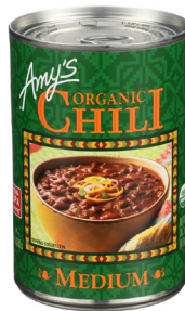
Amy's Organic Chili (selected varieties)

At Amy's, we source the best organic ingredients and take the time to perfect our recipes to make sure each bite tastes delicious.