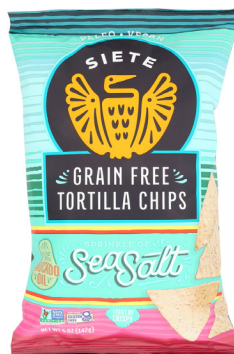
Siete Tortilla Chips selected varieties