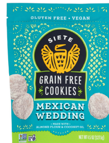
Siete Grain Free Cookies selected varieties