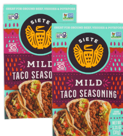
Siete Seasoning selected varieties

Siete is a Mexican-American food brand, rooted in family, that creates delicious, heritage-inspired foods for more people to enjoy—like Grain Free Mexican Wedding Cookies! Bite-sized, crunchy, and sweet, they're just the thing for lunch box packing and midday snacking.