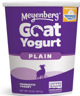
Meyenberg Goat Milk Yogurt selected varieties

Since 1934, Meyenberg has been bringing the goodness of goat milk to people from coast to coast. Our fresh milk and our creamy yogurt are both delicious and easy to digest, as well as being Certified Humane and certified Kosher.