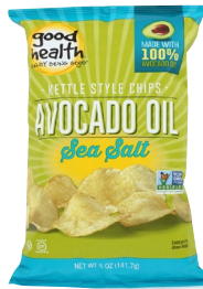
Good Health Avocado Oil Potato Chips selected varieties