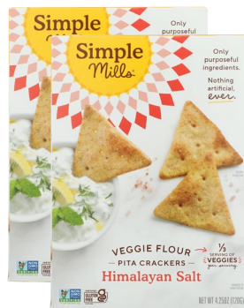
Simple Mills Gluten Free Pita Crackers selected varieties

Simple Mills cookies, crackers, and bars deliver delicious flavor with purposeful ingredients—ideal for summer entertaining, everyday munching, and convenient grab-and-go snacking all month long.