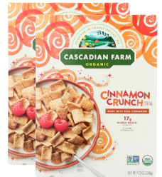
Cascadian Farm Organic Cereal selected varieties