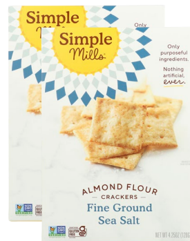
Simple Mills Gluten Free Crackers selected varieties