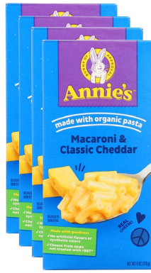
Annie's Mac & Cheese selected varieties

From partnering with the farmers who grow our food, to thoughtfully choosing the packaging that our food is packaged in – we've always had your family and our planet in mind.