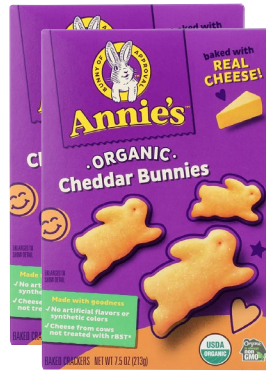
Annie's Organic Bunny Crackers selected varieties