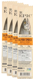
EPIC Snack Strip selected varieties