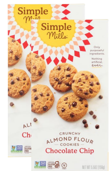
Simple Mills Gluten Free Cookies selected varieties