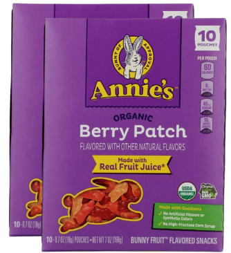
Annie's Organic Fruit Snacks selected varieties