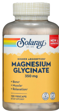
Solaray Higher Absorption Magnesium Glycinate