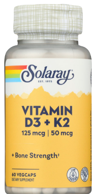
Solaray Vitamin D3 + K2

Since 1973, Solaray has believed that quality should be proven, not promised. That's why our 700+ vitamins, minerals, and herbs are made in Utah with global ingredients that are triple-tested for purity and potency—ensuring quality in every capsule.