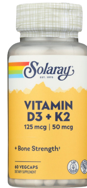
Solaray Vitamin D3 + K2

Since 1973, Solaray has believed that quality should be proven, not promised. That's why our 700+ vitamins, minerals, and herbs are made in Utah with global ingredients that are triple-tested for purity and potency—ensuring quality in every capsule.