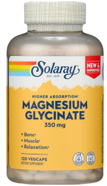
Solaray Higher Absorption Magnesium Glycinate