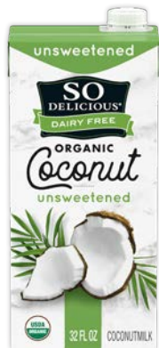
So Delicious Organic Coconut Milk selected varieties