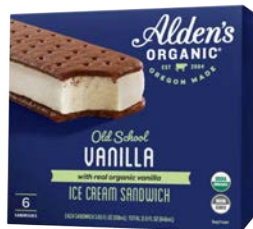
Alden's Organic Organic Ice Cream Sandwiches

Made with organic ingredients and a focus on responsible sourcing, Alden's Organic is a Certified B Corp committed to supporting communities—bringing rich, creamy ice cream to your table while doing things the right way.