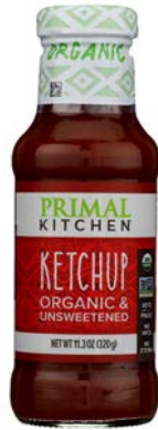
Primal Kitchen Organic Ketchup

Add bold, crave-worthy flavor to the real foods you love with Primal Kitchen Organic Unsweetened Ketchup and Mayo with Avocado Oil. Our premium pantry staples are made with real ingredients like organic California-grown tomatoes and cage-free eggs for a classic taste that kids and parents love. No artificial sweeteners and no nonsense!