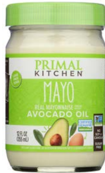
Primal Kitchen Mayo