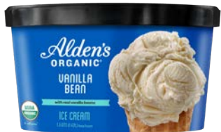
Alden's Organic Organic Ice Cream selected varieties