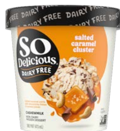
So Delicious Plant-Based Frozen Dessert selected varieties