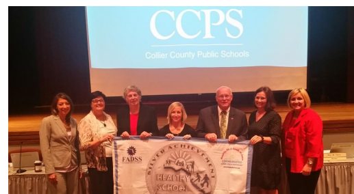
Healthy School District-Collier-Silver