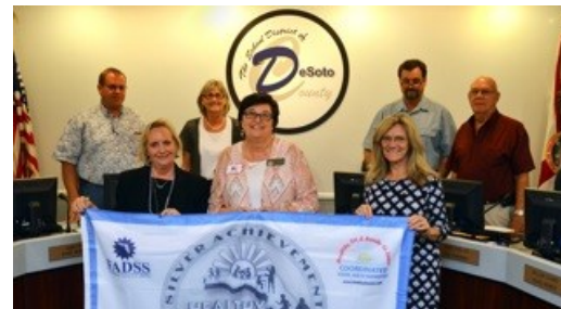
Healthy School District-DeSoto-Silver

To see the application or to find out if your district is a Healthy School District award winner, go to www.healthydistrict.com . Districts keep their award for two years. Applications open January 15th and close April 15th. Let's join the voices of others in our state in advocating for healthy school districts throughout the whole state!