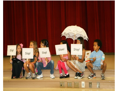
Palm Beach Public School – Melanoma Monday

recognize this chance to solve a difficult problem that plagues our young people. With education, melanoma is almost one hundred percent preventable!