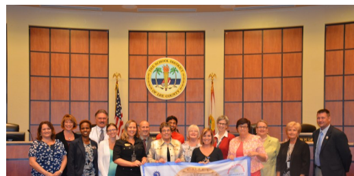
Healthy School District - Lee - Gold