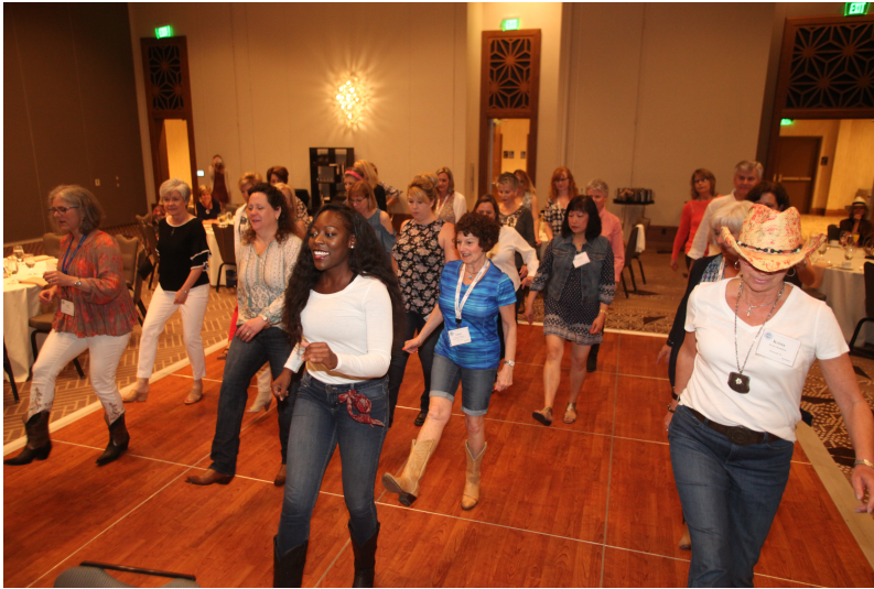
Line dancing lessons added to the fun festivities.