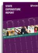
State Expenditure Report 2021