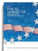
Fiscal Survey of States Fall 2021

Reports available for download at www.nasbo.org