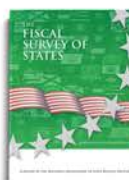
Fiscal Survey of States Spring 2022