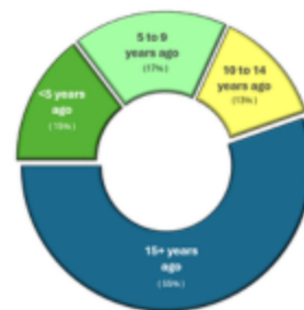
Years Since Current Boat Owners Purchased Their First Boat

This presents an interesting challenge / opportunity from a boating safety education and outreach perspective because some people are in fact "newbies" while many others probably consider themselves to be avid boaters.