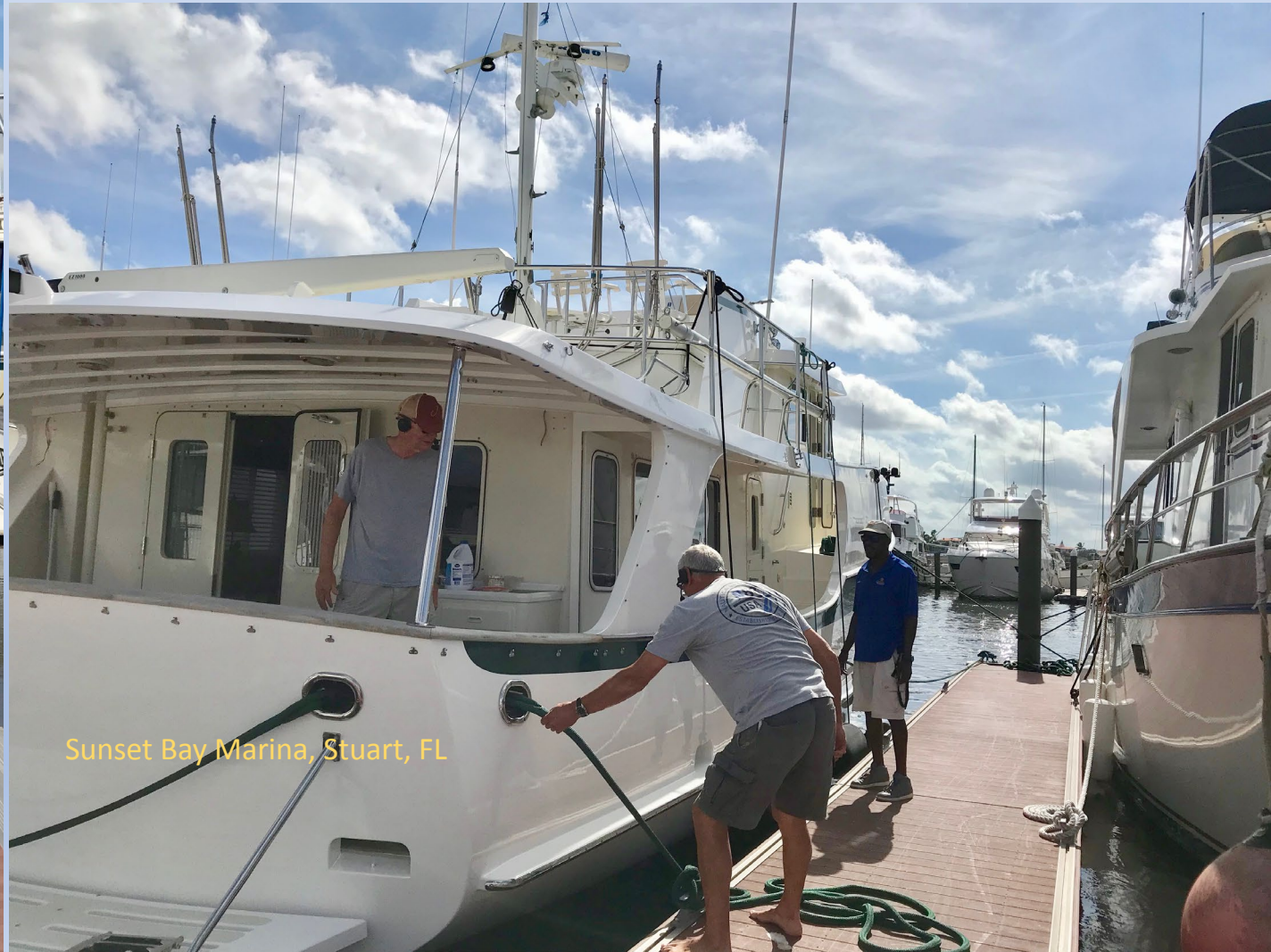
Sunset Bay Marina, Stuart, FL