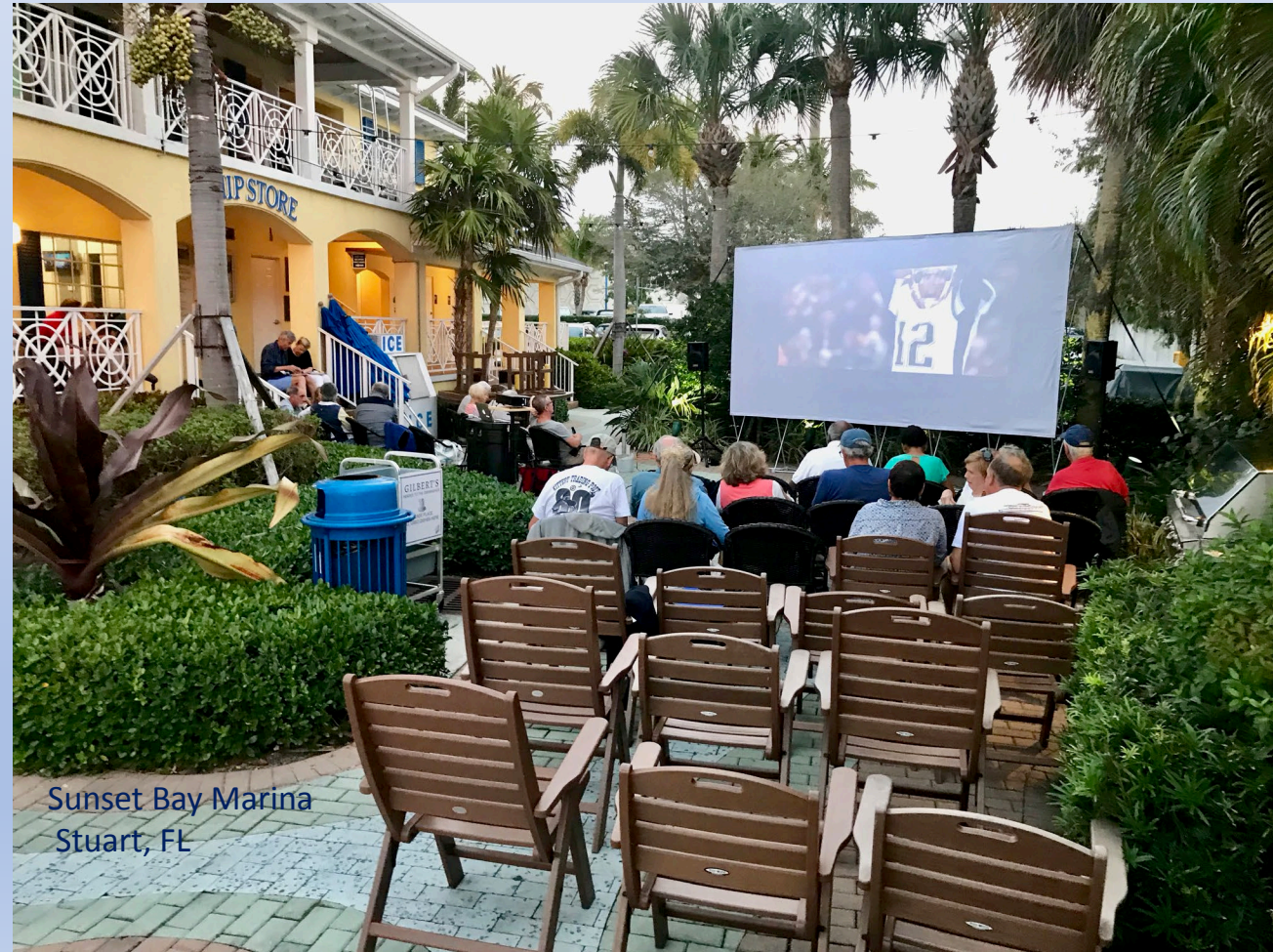
Sunset Bay Marina Stuart, FL