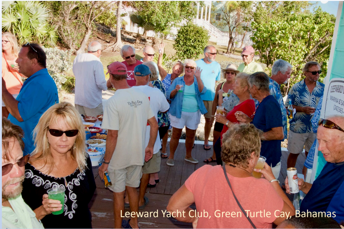
Leeward Yacht Club, Green Turtle Cay, Bahamas