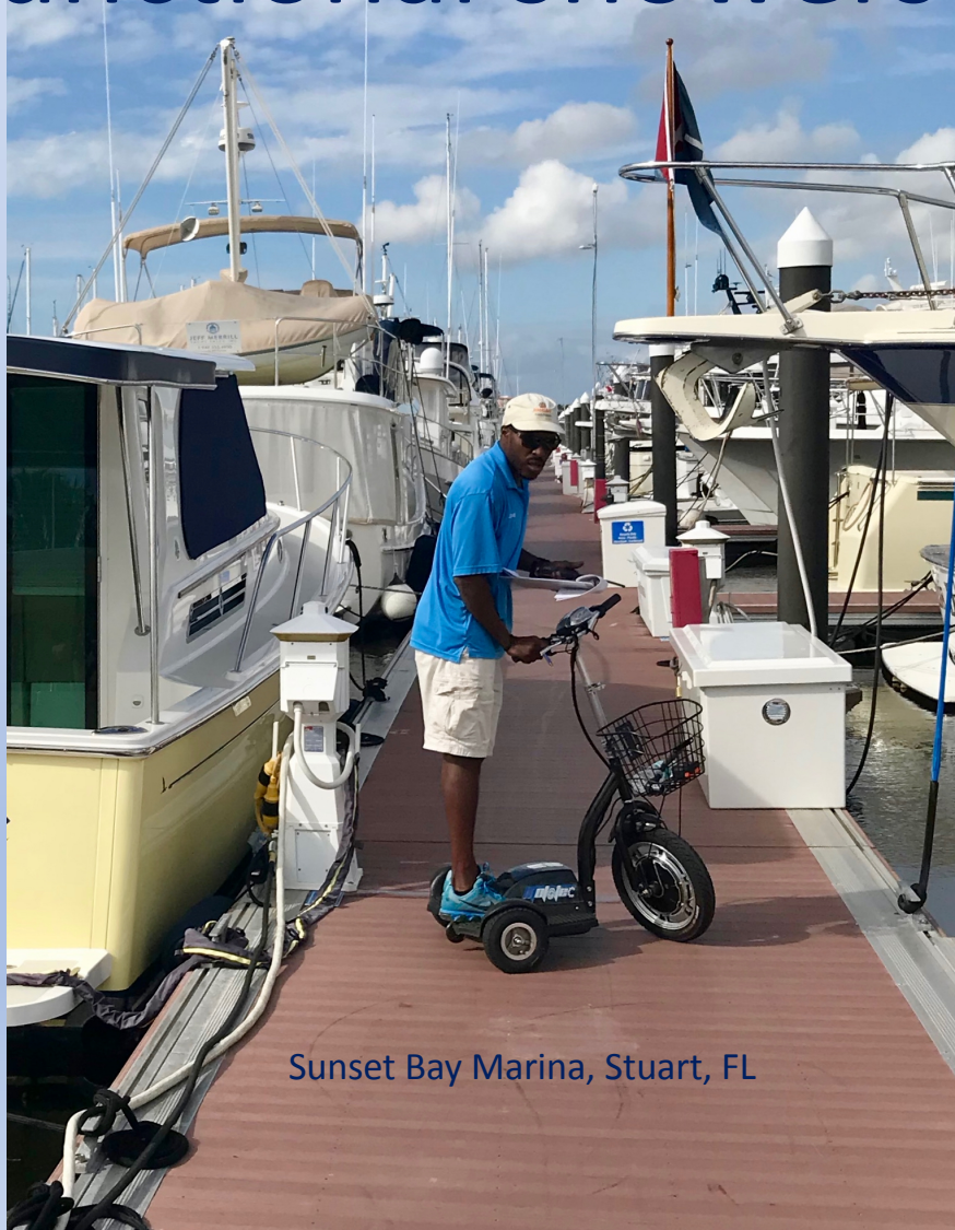
Sunset Bay Marina, Stuart, FL