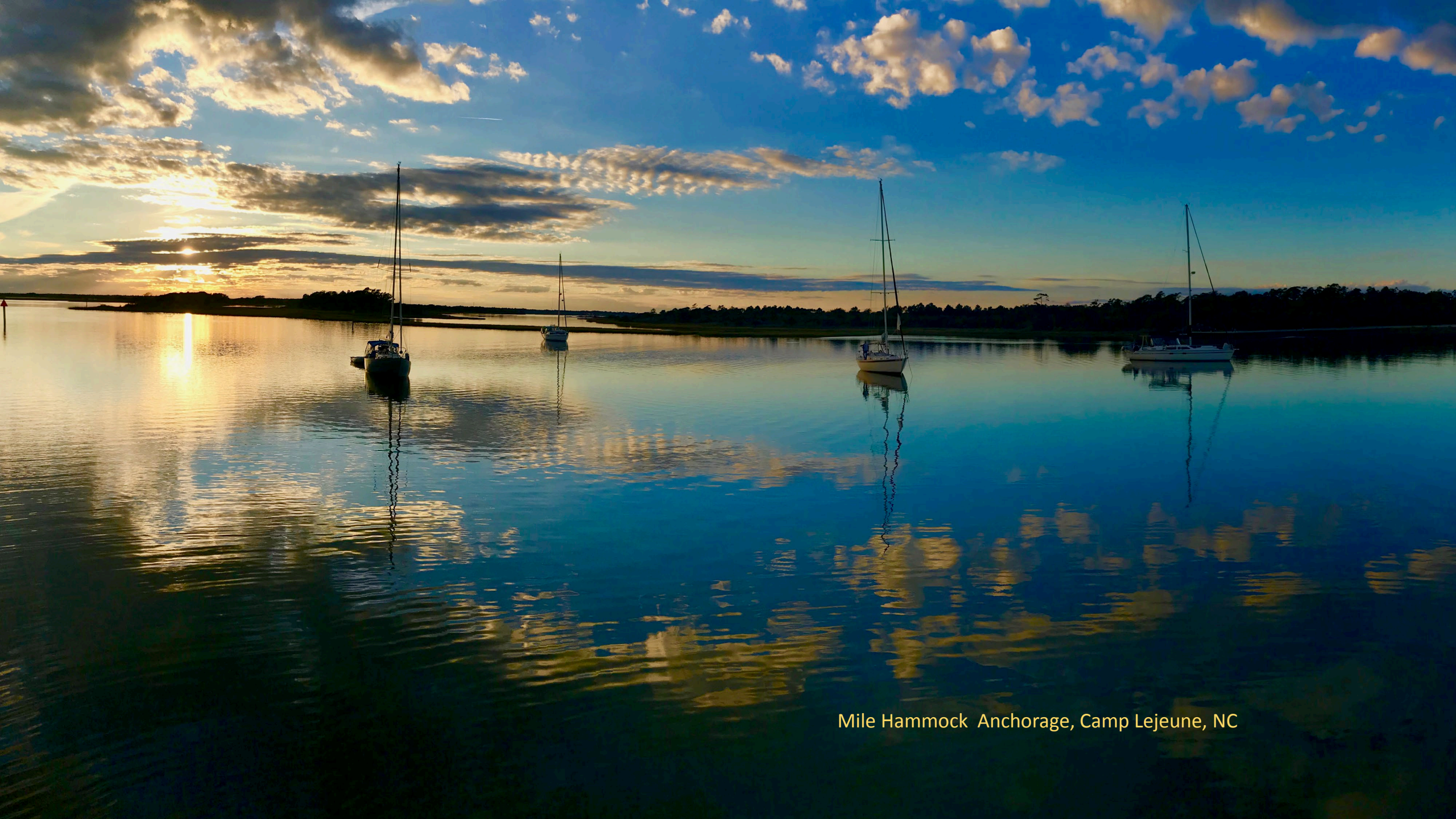
Mile Hammock Anchorage, Camp Lejeune, NC