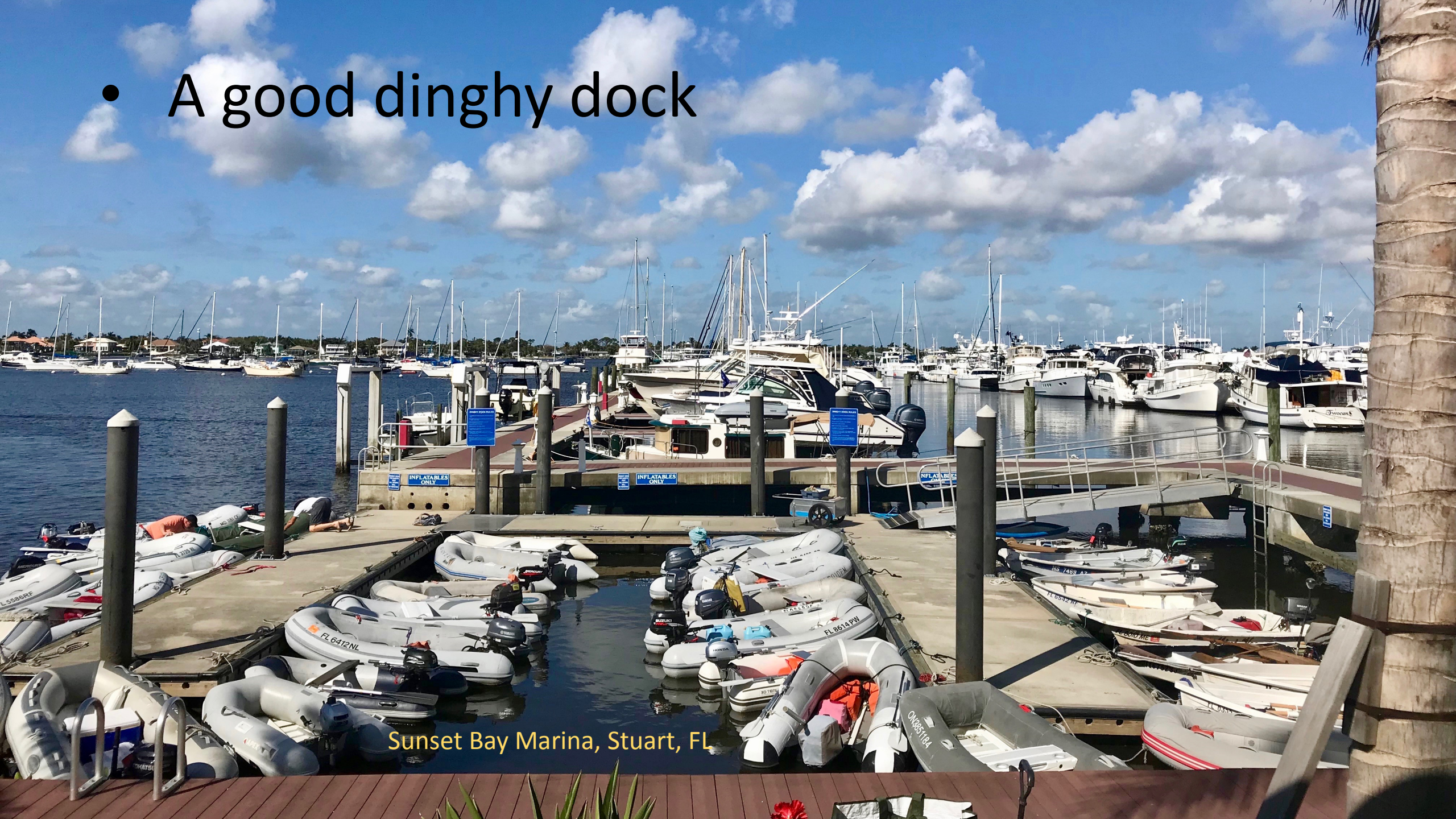
Sunset Bay Marina, Stuart, FL