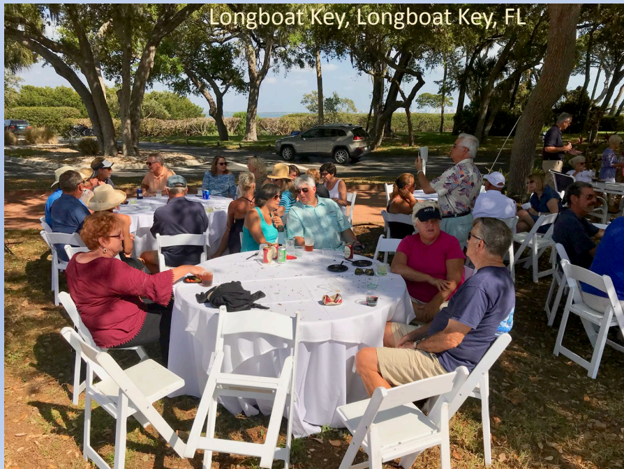
Longboat Key, Longboat Key, FL