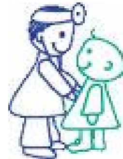
FIGURE 1. Recommended immunization schedule for persons aged 0–6 years — United States, 2007