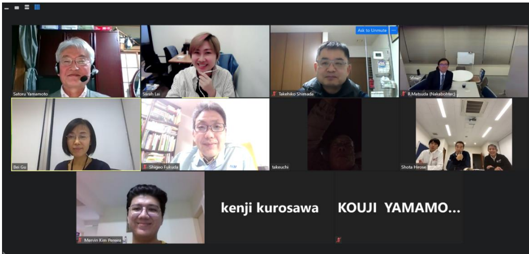
NACE Tokyo Japan Section and SSPC Japan Chapter Leaders interacting virtually