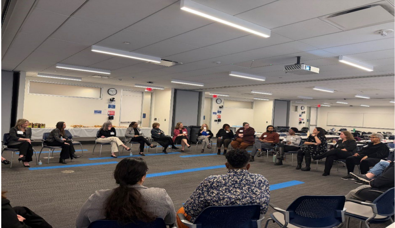
Members of the NYC LAN engage in meaningful dialogue and community building during the conference program.