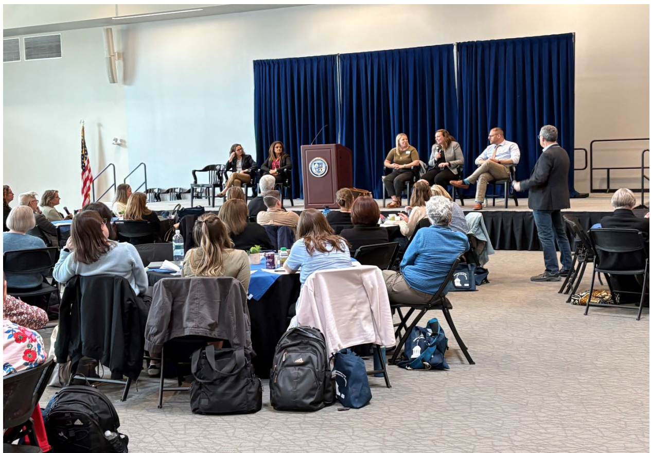
Attendees participated in an afternoon panel discussion on admissions topics.