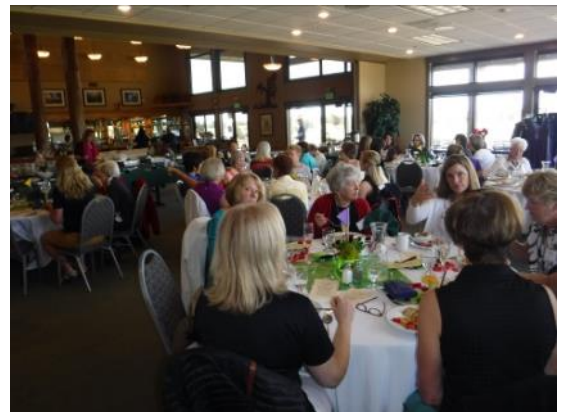
2016 Kickoff Breakfast