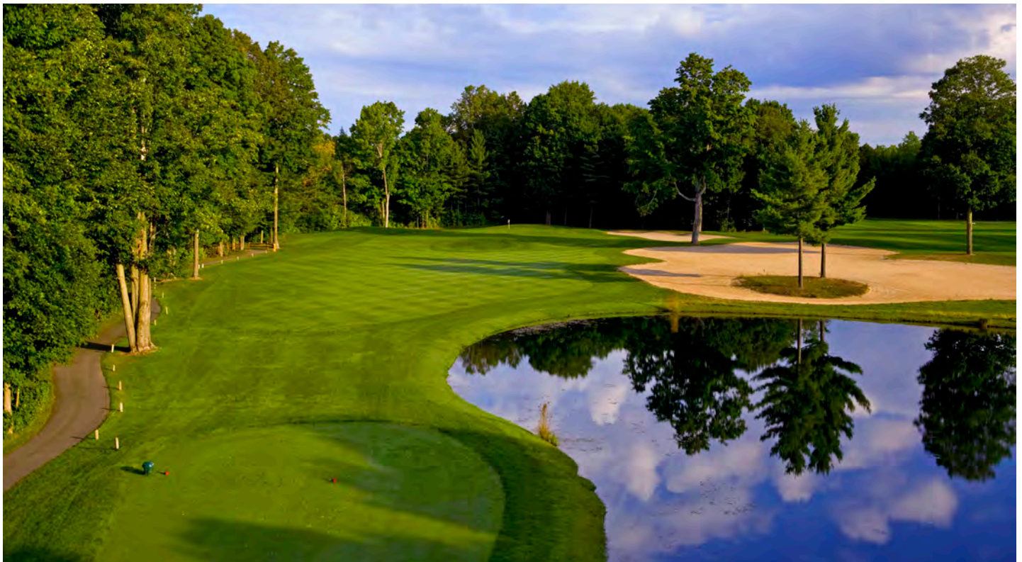
Crystal Mountain Courtesy Photo

Breakfast at Thistle Pub & Grill at Crystal Mountain (Dutch treat)