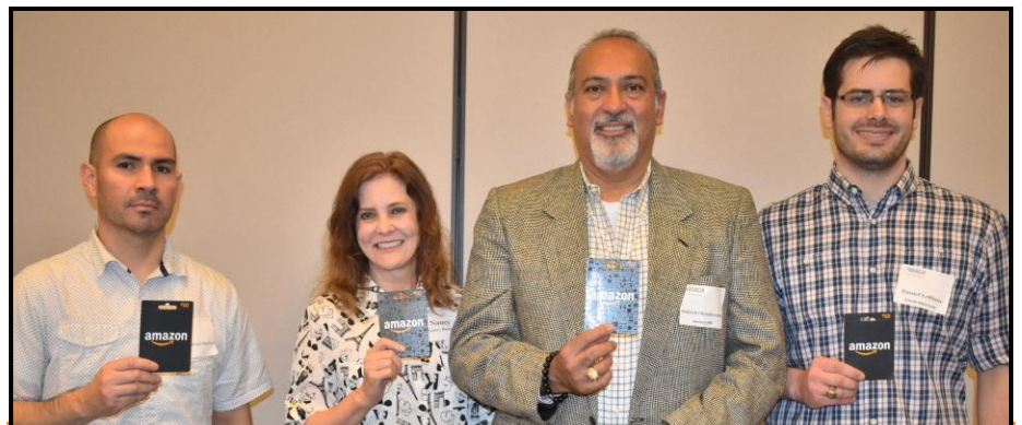
June Meeting Door Prize Winners

**Note about Presentations: ISACA North Texas can only post presentations from monthly meetings that are provided by the speaker with their permission. If a presentation is not on the website it either means we have not been granted permission or the speaker has not provided us the presentation