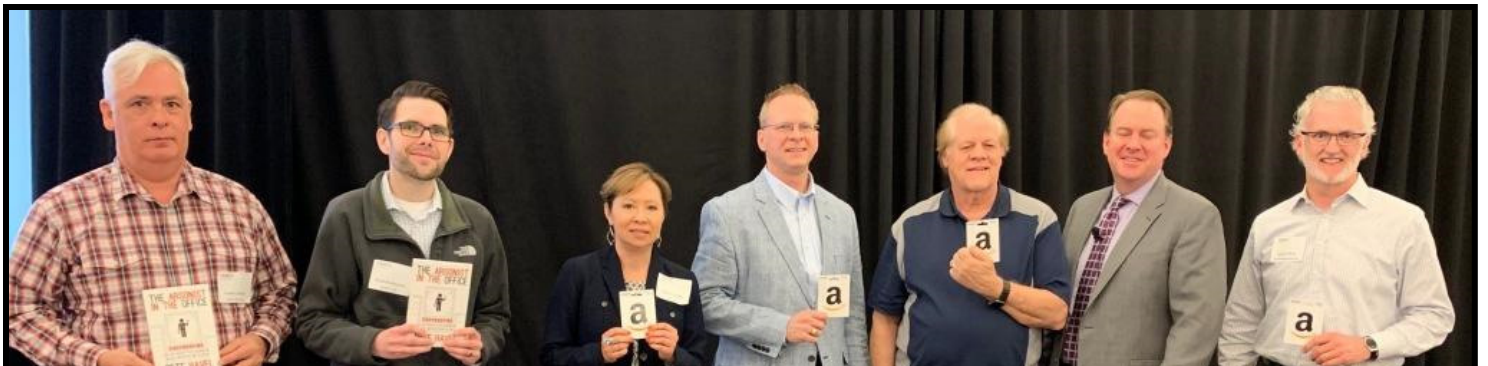
April Meeting Door Prize Winners

**Note about Presentations: ISACA North Texas can only post presentations from monthly meetings that are provided by the speaker with their permission. If a presentation is not on the website it either means we have not been granted permission or the speaker has not provided us the presentation to post yet.