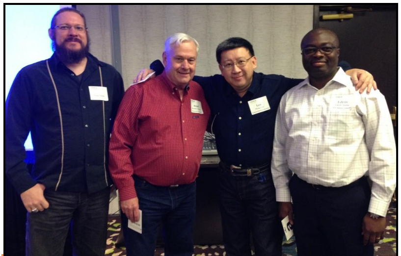
October Meeting Door Prize Winners

**Note about Presentations: ISACA North Texas can only post presentations from monthly meetings that are provided by the speaker with their permission. If a presentation is not on the website it either means we have not been granted permission or the speaker has not provided us the presentation to post yet.